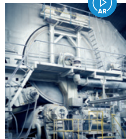
ANDRITZ high-performance PrimeDry Steel Yankees are made entirely of steel, contributing to enhanced safety and 8 - 10% better machine performance when compared to a cast Yankee.