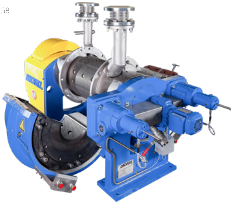
ANDRITZ Papillon refiner with its compact cylindrical rotor design

and allow for fast grade changes on the machine. For refining, the Papillon refiner has a compact cylindrical rotor design. Energy savings can be quite significant when compared to competitive refiners, and the fiber is properly treated over the entire refining area.